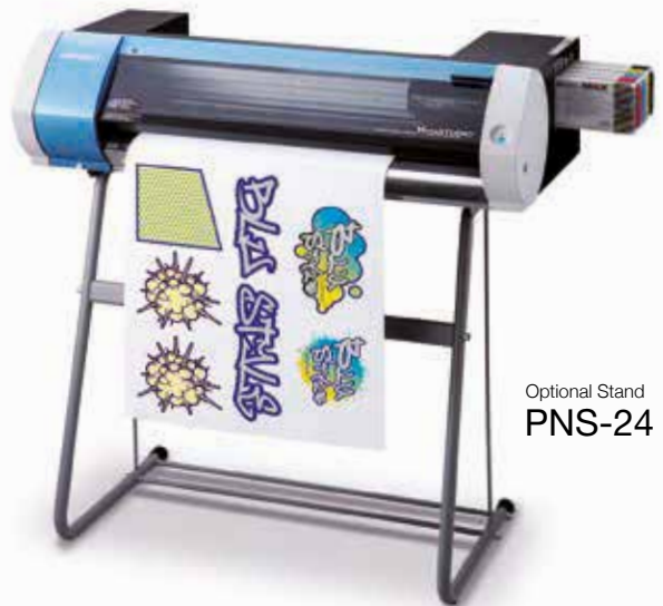
Optional Stand PNS-24