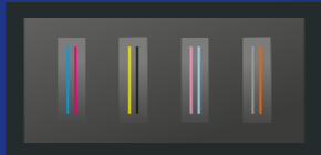
VG2 series (4 heads)

FlexFire Printhead Roland DG FlexFire printheads maximise printing performance so that even the highest speed setting delivers neutral greys, vivid colours and smooth skin tones.