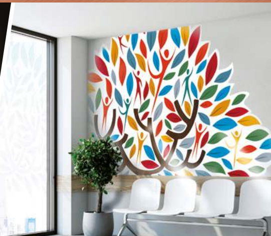
WINDOW AND WALL GRAPHICS