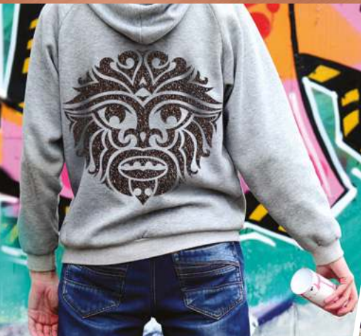
HEAT TRANSFER APPAREL