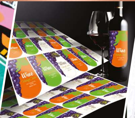
CONTOUR CUT LABELS