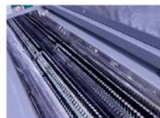
Flip top powder box, simple operation, convenient to add powder.