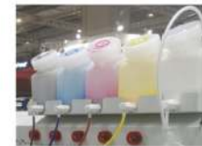
Stable bulk system ensures amazing printing speed.