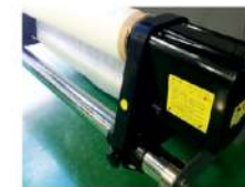
External power supply, intelligent rolling system.