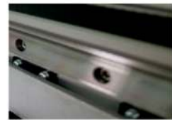
THK high-precision mute rail.