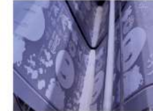
Efficient powder shaking device, powder shaking is clean.