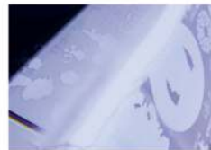
High-quality hot-melt powder, can be used repeatedly.