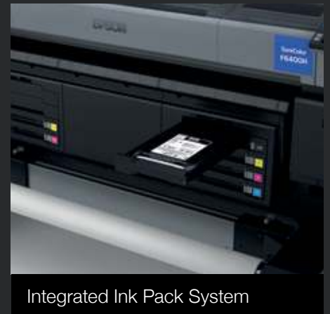
Integrated Ink Pack System