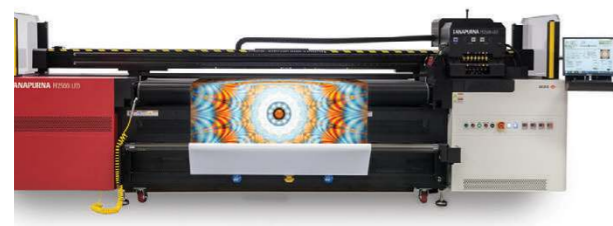
Anapurna H2500i LED