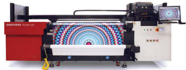
Anapurna H1650i LED