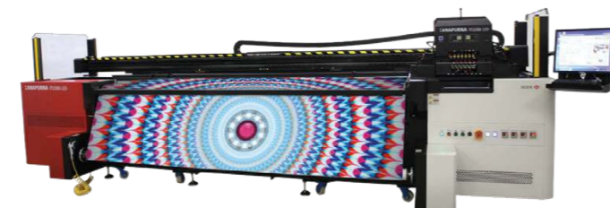
Anapurna H3200i LED