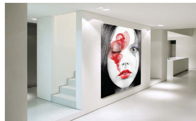
In-house decoration – dibond

Thanks to the high pigment load of our inks, ink consumption per square meter is the lowest on the market. This 'thin ink layer' pigment dispersion technology not only results in eye-catching prints; it also helps preserve the environment and saves on your budget. In short, these inks offer the best possible price/quality ratio.