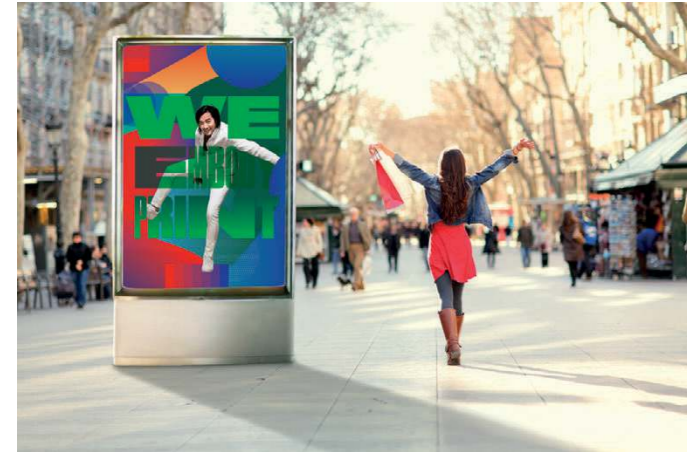
Outstanding print quality on backlit applications

The wide-format hybrid Anapurna i LED-series is a perfect fit for sign shops, digital printers, photo labs and mid-size graphic screen printers that want to combine board and roll-to-roll print jobs. The engines print at a width up to 3.2 m and combine excellent quality with high productivity for outdoor and indoor jobs. The hybrid Anapurna's are equipped with UV LED lamps, enabling you to print on a wider media mix and to save energy, costs and time. The white ink function creates possibilities for printing on transparent material for backlit applications or for printing white as a spot color. With the optional automatic board feeder, productivity is increased even more.