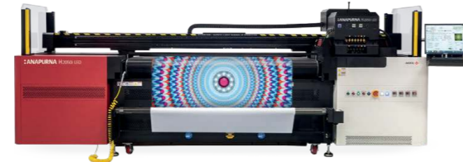
Anapurna H2050i LED