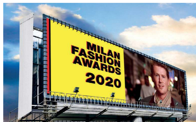
Outdoor communication – vinyl

Printing on backlit media? Creating an opaque white background? Using white as a spot color? The hybrid Anapurna LEDs supports white printing in multiple modes (e.g. pre-white, post-white, sandwich white) on both rigid and roll media. The stirring functionality keeps the white ink in motion at all times. Constant recirculation flows along the ink lines—all the way to the temperature-controlled printer heads—limiting the risk of ink resettling and lines becoming blocked or clogged.